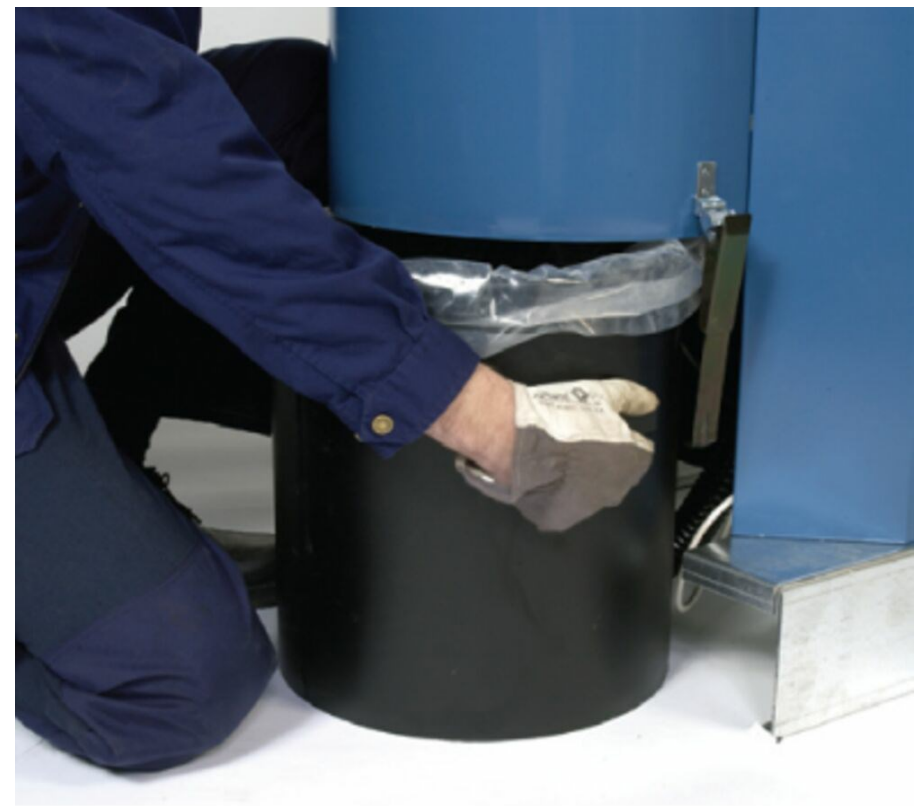
The plastic bin liner is easy to change